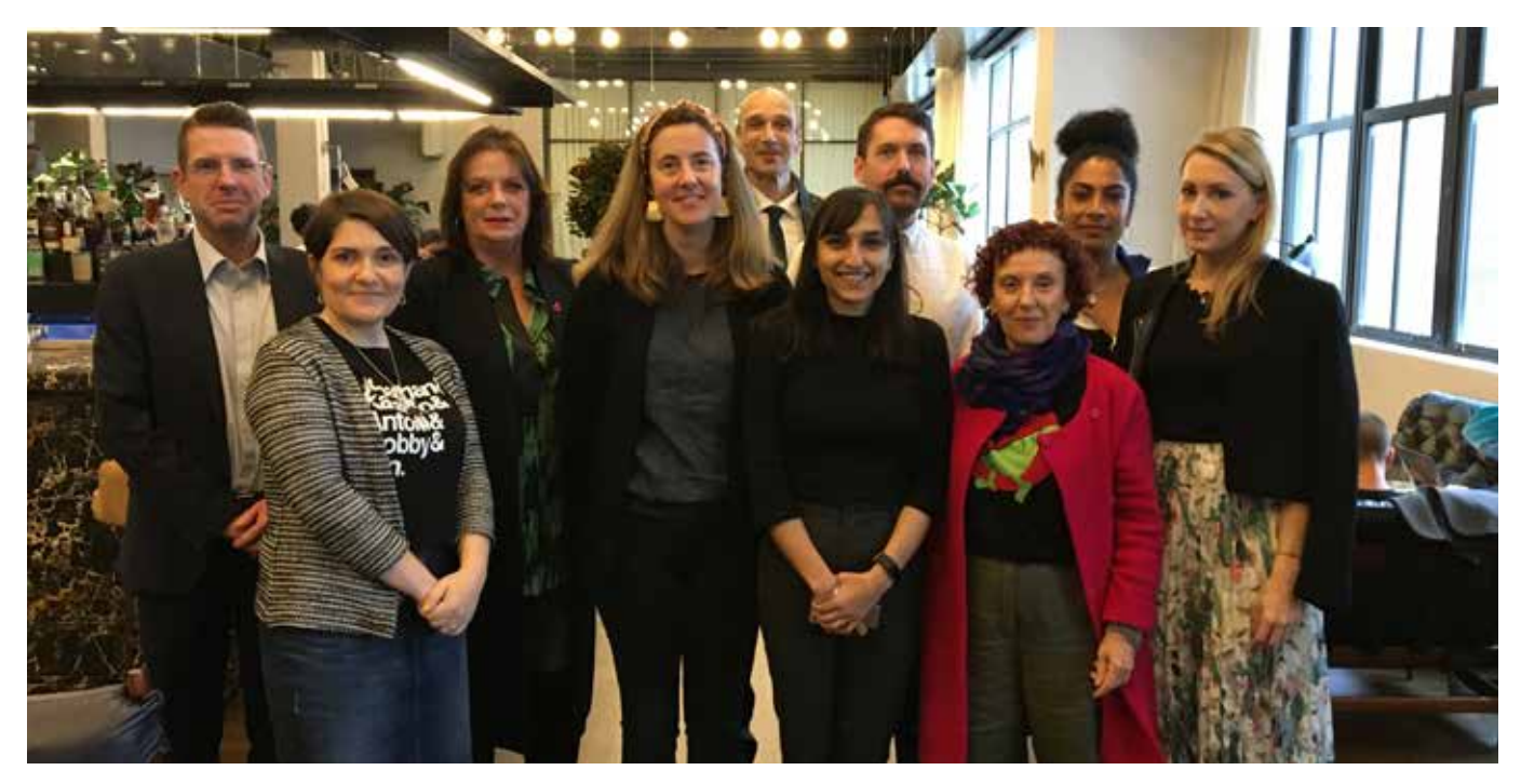
The UK delegation meeting with New York Fashion Tech Lab at Spring Place.

The goal of the presentation day is to gain exposure to potential customers and investors. The Lab keeps a database of companies that could be eligible so that they can manage applications.