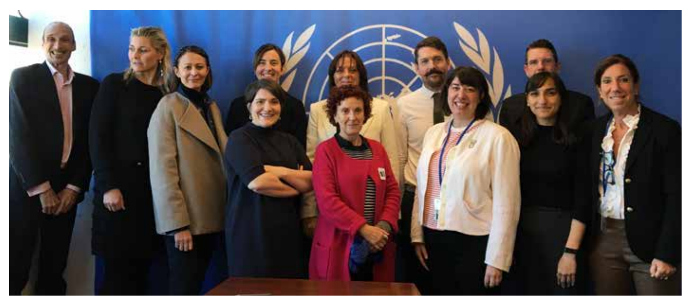
The UK delegation meeting with the United Nations.

The Conscience Fashion Campaign, in collaboration with the United Nations Office for Partnerships, engages global industry events to commit to the achievement of the Sustainable Development Goals. The initiative champions fashion as an influential sector to address the world's most pressing issues and lead a future that leaves no-one behind. The campaign is dedicated to driving change through advocacy, education and engagement of industry stakeholders to create a sustainable future for all.